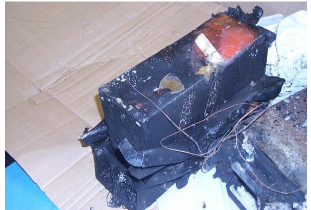
Figure 2 -Exterior View