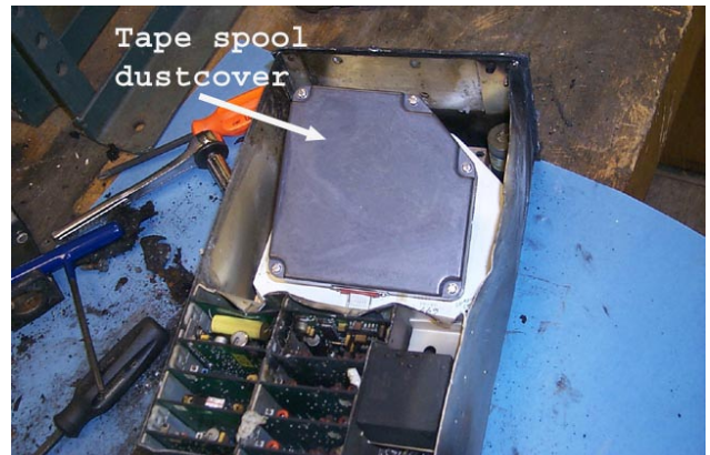
Figure 4 - "Crash Case" Removed