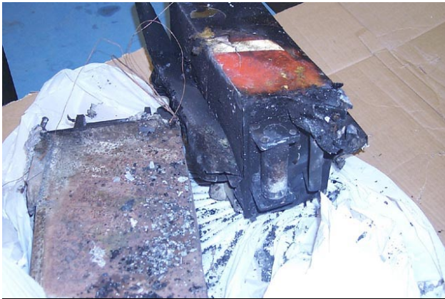
Figure 1 - Exterior View